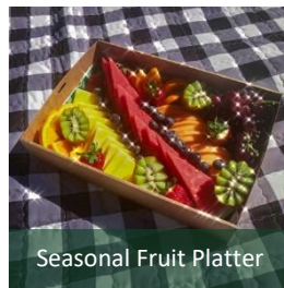
Seasonal Fruit Platter