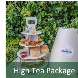
High Tea Package